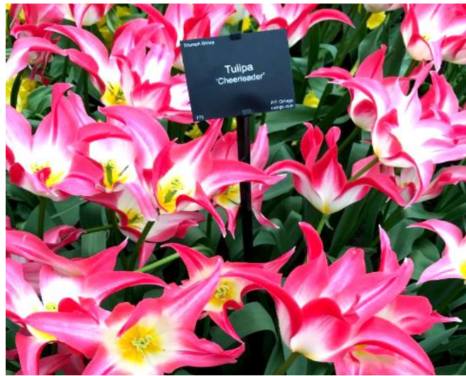
A bed of exotic tulips Keukenhof