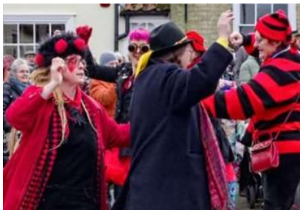
'Ox Blood Mollies' Halesworth

The ninth 'Halesworth Day of Dance' will take place on Saturday, April 5th. This celebratory spectacular of dancing, music and costumes takes place throughout the town, from 11am until 4pm, starting with a parade and mass dancing in the Market Place. The streets will then be full of live musicians and dancers to be followed by an evening Ceildh at the newly refurbished Rifle Hall. Join over eighteen local dance groups including traditional Molly and Morris Dancers. It's a free and unique event for young and old. Don't miss it.!