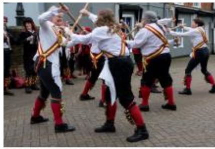
'Gold Star' of Norwich