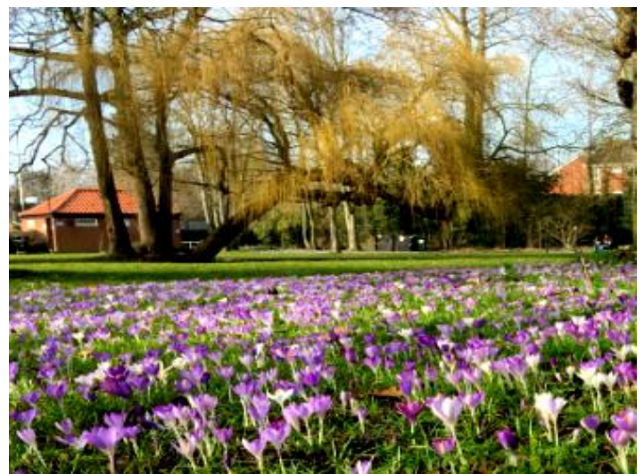
A bed of Crocuses - Halesworth Town Park

How idyllic winter appears in Van der Bowlen's 'Dutch Winter Scene', but this was far from the harsh reality of winter experienced by peasants, working long hours in cold and miserable conditions and in a flat wind-swept landscape. No wonder Spring was such a relief and certainly one reason for the serious cultivation of bulbs in the Netherlands in the seventeenth century. A source of income certainly, but what a wonderful harbinger of Spring they must have been.