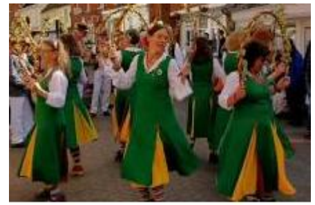
From The First Festival - 2017