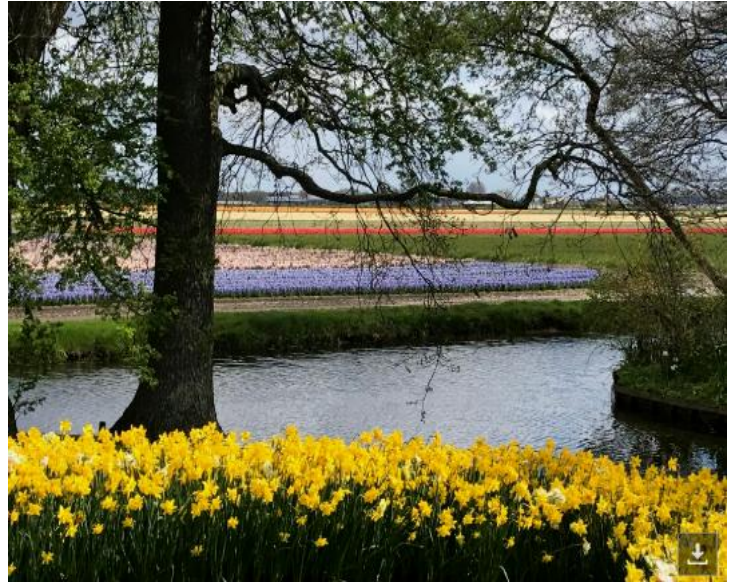
Bulb fields - Keukenhof, Holland