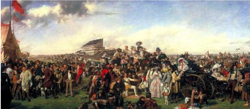
Derby Day by William Frith – Tate Gallery