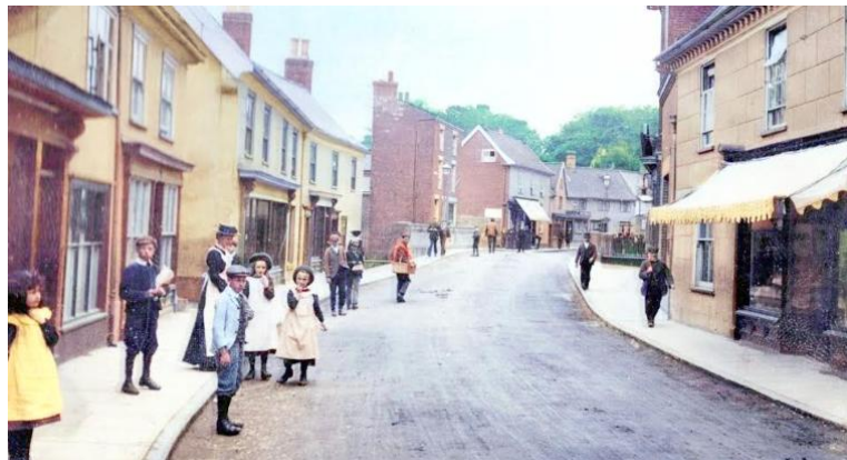
The Thoroughfare re-imagined.

The Local History Group has a busy summer ahead, with involvement in the Ale Day (14 June) and guided walks for Visit Halesworth, East Suffolk Lines and other groups. Some of us went on an enjoyable history stroll in Great Yarmouth organised by the Walpole Old Chapel History Group. Our Quay Street group are preparing for their new guided walk, showcasing their fascinating research on Quay Street and the brewing and maltings heritage of the town. This will be unveiled during the Heritage Open Days in September, where our group will be at the I-Chamaeleon shop, promoting Halesworth's heritage as well as running family history sessions and guided walks. Open days at Bank House and many other events will feature. Towards the autumn we are excited to be preparing to launch our interactive digital project, which will deliver the fruits of our streets, buildings and people research onto a multi-layered interactive map of Halesworth.