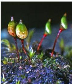
Buxbaumia Aphylla Plant Source website

Luckily for the world of botany, but not for his personal finances, William Hooker's time in the malting trade, was unsuccessful. He had meanwhile made a name for himself as a botanist. By the time he had settled in Halesworth, he had already discovered a new variety of moss close to Norwich ( Buxbaumia aphylla ) and two years later another in Scotland. He had previously made the acquaintance of the famous Sir Joseph Banks, who had been a botanist with Captain Cook on his voyages in the Endeavour. Enquiring whether, with his research and experience, he had any future in botany, Hooker was rewarded with the Chair of Botany at Glasgow University. By all accounts he was a gifted lecturer and admired by his students.