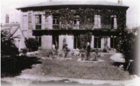
Brewery House - now Hooker House