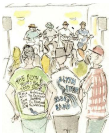
A sketch of the band taken by a fan