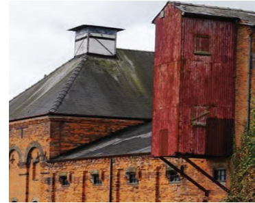
Today's Maltings Legacy